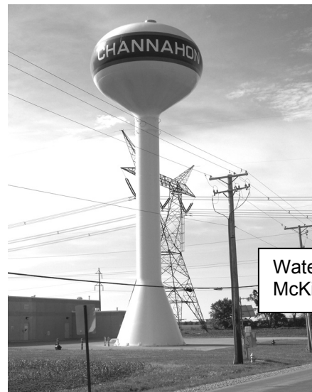
Water Tower McKinley Woods Road

Many residents may have noticed the new tower being erected on Bluff Road. The old tower it is replacing was purchased used from a southern state and reassembled here in Channahon in the early 1970's. This will increase our water storage from 200,000 to 750,000 gallons, making sure we have enough water on hand to supply residents and for firefighting purposes. It will be operational this year and will be painted in our Channahon logo colors, teal and purple.